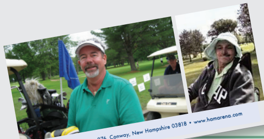
TEL/FAX 603.447.5888 • P.O. Box 276, Conway, New Hampshire 03818 • www.hamarena.com