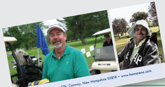
TEL/FAX 603.447.5888 • P.O. Box 276, Conway, New Hampshire 03818 • www.hamarena.com